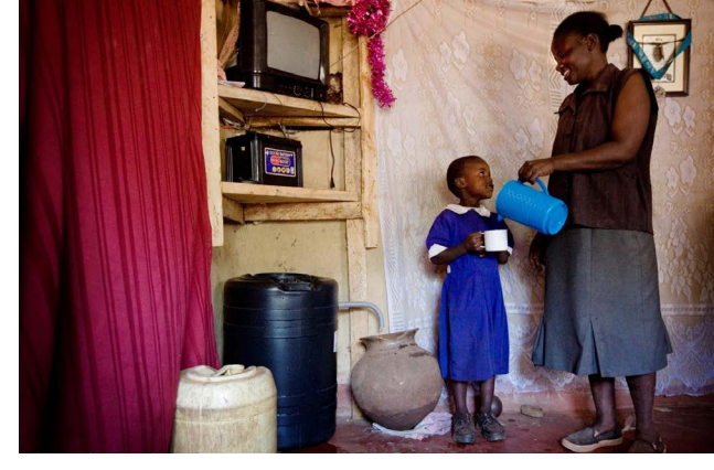
The Aqua Clara Water Filtration Programme

Project Description: In 2020 Evolution Marketing made the strategic decision to support the <u>Aqua Clara Water Filtration Programme based in Kenya, Africa</u> via our participation in the Carbonfree® Business Partner Program. This project supports the distribution of the <u>zero-energy ACF</u> water purifier that displaces the <u>use of firewood fuel traditionally used to boil water for domestic consumption</u>. This project is also Gold Standard verified and contributes to meeting multiple <u>Sustainable Development Goals</u> (they are below SDG 3, 6, 8, 9 and 13).